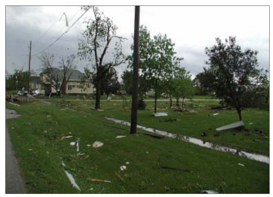
An F2 twister wound its way through Bradgate Friday night. The tornado was 1/2 mile wide and created a damage path two miles wide by 8 miles, wreaking havoc over two towns and many farms in between. The town of Bradgate, 100 people, will hopefully be rebuilt, but it will be no easy task.

Some say the sounds are like a freight train. The sounds for us were deafening, pure havoc being released. If there was a howl, we couldn't hear it. All we heard was the high-pitched hiss of wind as it forced its way through, not around,