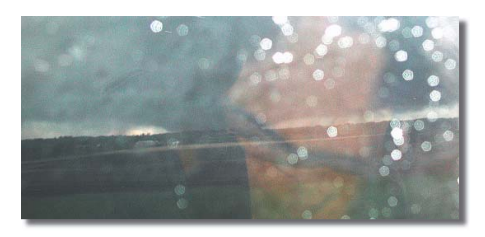
From the fields to the streets of Bradgate, the F2 tornado that roared through central lowa Friday, May 21, 2004 will be remembered for the damage it caused to homes and businesses in this town of 100 people.