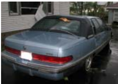
The Buick Roadmaster above was hammered by the 127 mile-per-hour winds that were a major part of the tornado that hit Bradgate, Iowa, on May 21, 2004 at approximately 6:19 p.m. The storm lasted minutes, but did tremendous damage.